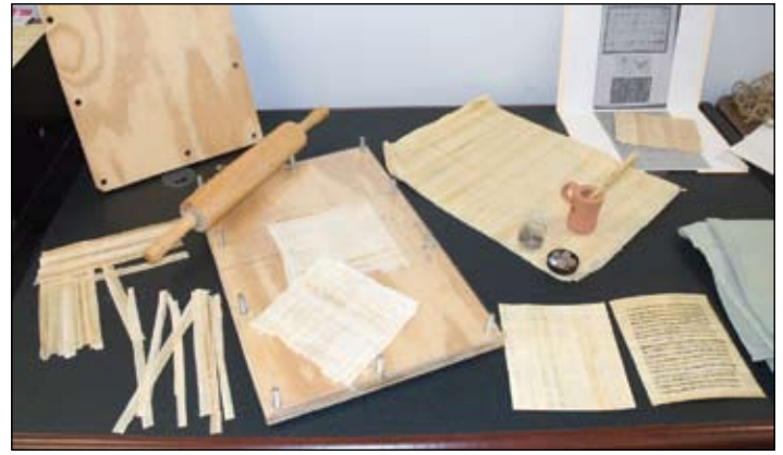
A papyrus-making display in the H. Milton Haggard Center for New Testament Textual Studies.

“One of the things I’ve tried to communicate to students here is that when you get into this