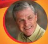
Allan Taylor Minister of Education FBC Woodstock

Registration Deadline: September 29 Conference + Dinner: $25