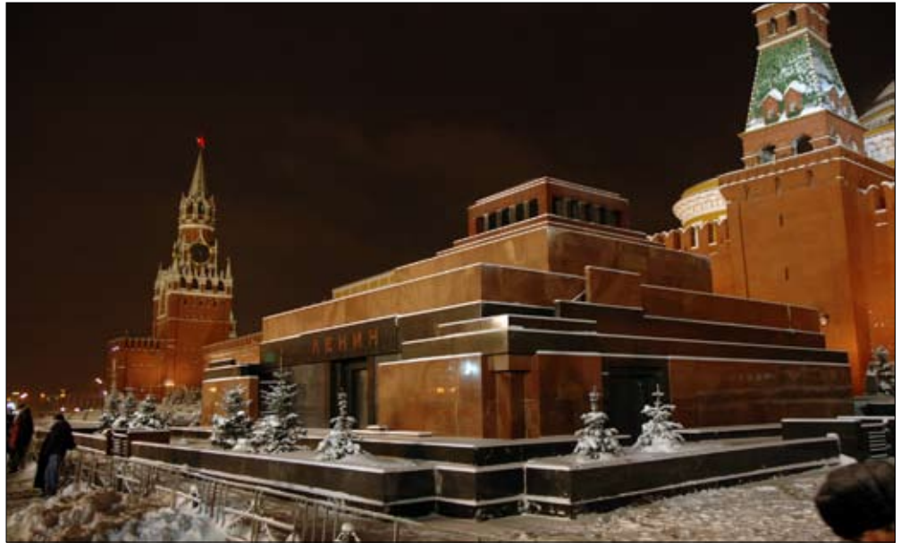
A nighttime view of Red Square and Lenin's Tomb in Moscow, Russia

The small food court was too small for the group of 11 volunteers. Four members of the team