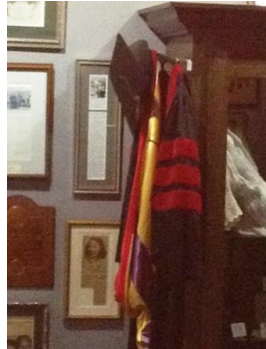
D-Min w/o Piping