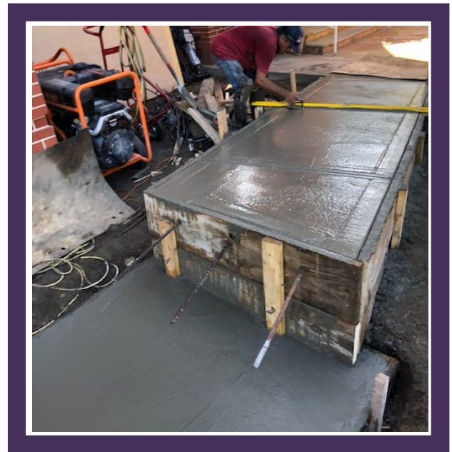
ADA Compliant ramp construction - Leavell Chapel